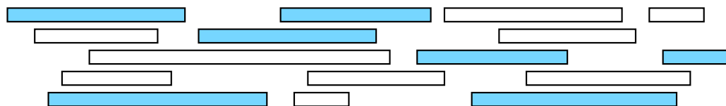
A set of intervals. The seven shaded intervals form a tiling path.

Describe and analyze an algorithm to compute the smallest tiling path of X as quickly as possible. Assume that your input consists of two arrays X_L[1..n] and X_R[1..n] , representing the left and right endpoints of the intervals in X .